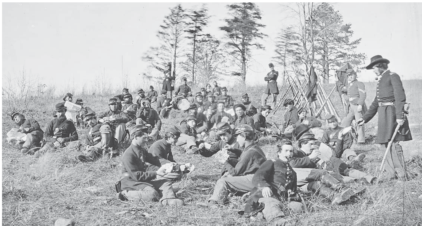
Infantry resting from drill (ARC Identifier 524639)